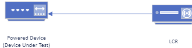
Figure 2: Test Setup for PD2.7

Figure 2 is the setup used for PD2.7, which is responsible for testing the input capacitance of the DUT. This setup only requires the DUT and an LCR.